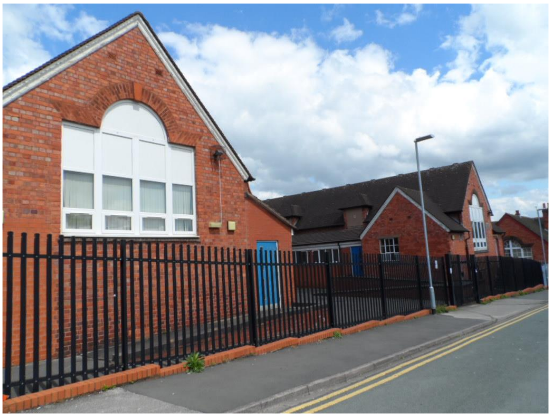
Figure 4 - Old School New Road

Conservation Area. It is not recommended that the conservation area is extended to incorporate these buildings.