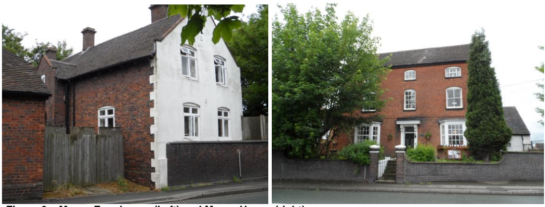
Figure 3 – Manor Farmhouse (Left) and Manor House (right)

2.4 As stated in the Wilnecote Conservation Area Appraisal 2008, there are surrounding buildings located throughout the area, such as the listed Grade II listed Manor Farmhouse and the Grade II listed Manor House along Hockley Road, and the Wilnecote Hall on Watling Street; which although contributing strongly to the historic interest of the area, do not form part of a coherent core area to allow these buildings to be included within the Conservation Area.