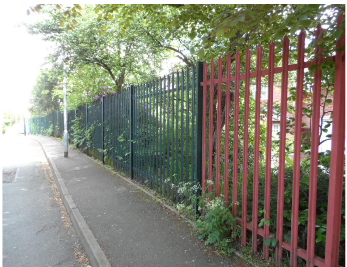
Figure 2 - Palisade Fence, Glascote Lane.

2.4 As stated in the Wilnecote Conservation Area Appraisal 2008, there are surrounding buildings located throughout the area, such as the listed Grade II listed Manor Farmhouse and the Grade II listed Manor House along Hockley Road, and the Wilnecote Hall on Watling Street; which although contributing strongly to the historic interest of the area, do not form part of a coherent core area to allow these buildings to be included within the Conservation Area.