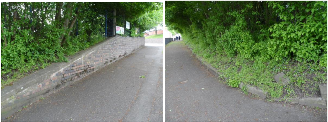
Figure 7 – Wall at the corner of Hockley and Watling Street requires cleaning and repairing of wall