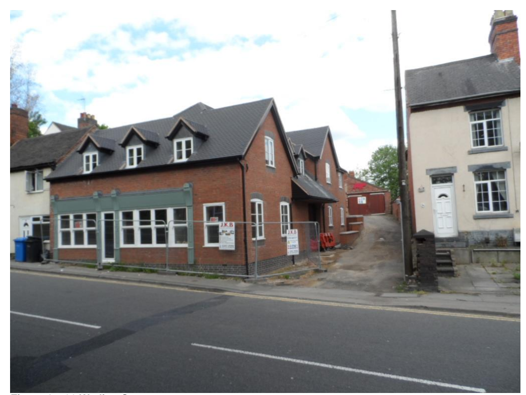
Figure 1 – 36 Watling Street

2.2 No.36 Watling Street was identified in the 2008 Conservation Area Appraisal as having a negative impact upon the character and appearance of the conservation area due to its neglected and derelict state. The Council has been working with the owner in order to develop a scheme which contains residential to the rear and redevelops the existing building and the installation of a new shop front (Figure 1). Although not yet finished, the scheme is a positive enhancement to the character and appearance of the conservation area.