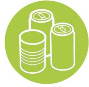
Food & drink cans