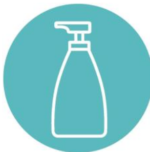
Plastic soap dispensers