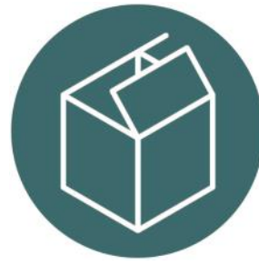
Cardboard, including boxes, toilet roll inners, food sleeves