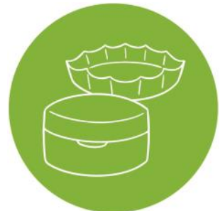
Plastic/metal bottle & jam jar lids