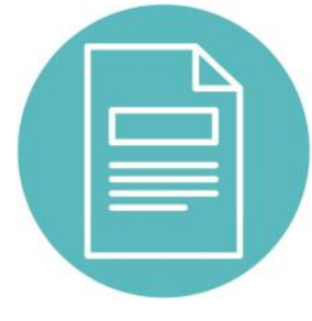
Paper, including magazines, wrapping paper, directories