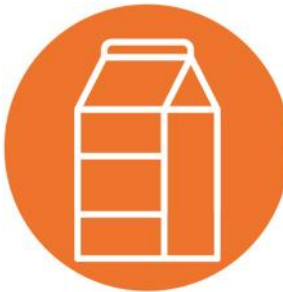
Waxed cartons, including juice and milk cartons