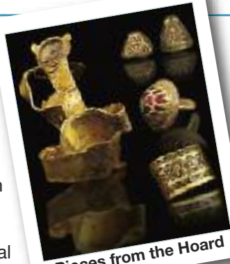
Pieces from the Hoard

The Staffordshire Hoard is set to come to Tamworth next summer, when key pieces from the £3.3 million Saxon find will go on show in Tamworth Castle's Great Hall. Work is also underway for a more permanent display and the development of a Mercian Trail. Next year's Tamworth Summer Festival will also have a Saxon theme and will celebrate Tamworth as the ancient capital of Mercia.