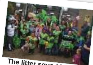
The litter squad tackles Glascote Heath.

Almost 50 bags of rubbish were collected, as well as an old sofa, a suitcase, and armchair, mattresses and – taking the prize for the oddest item found – a steering wheel.