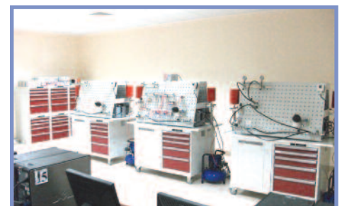
Mechatronics equipment for Royal Guard of Oman Technical College