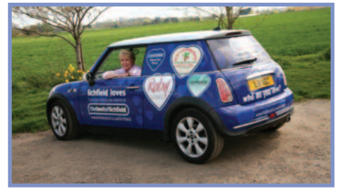
Louie Clegg, driving thebestoflichfield Mini