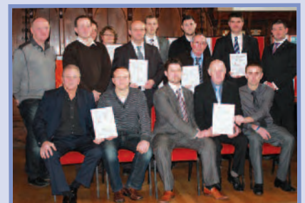
Winners Lichfield and Tamworth Building Excellence Awards

Partnership Work Winner: Burntwood Morrisons (Lichfield District) – Clugston Construction