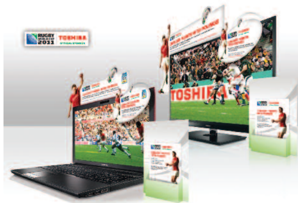
Toshiba Rugby World Cup Pack designed in Tamworth