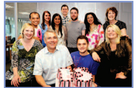
The MMS team celebrate 15th anniversary